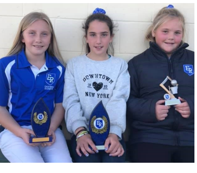
Congratulations to the E2 Grade -Runner Up Best & Fairest: Sa-