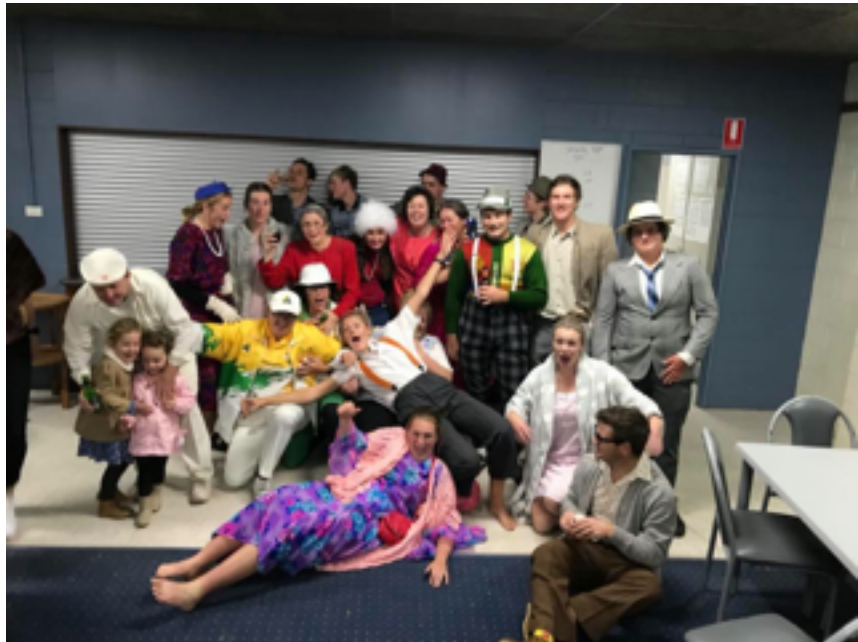
The Social Club Committee are working hard to provide activities at the club and plenty of laughs. The Senior Citizens Night was a huge success!

Keep an eye out on the Facebook page & Posters around Rudall.