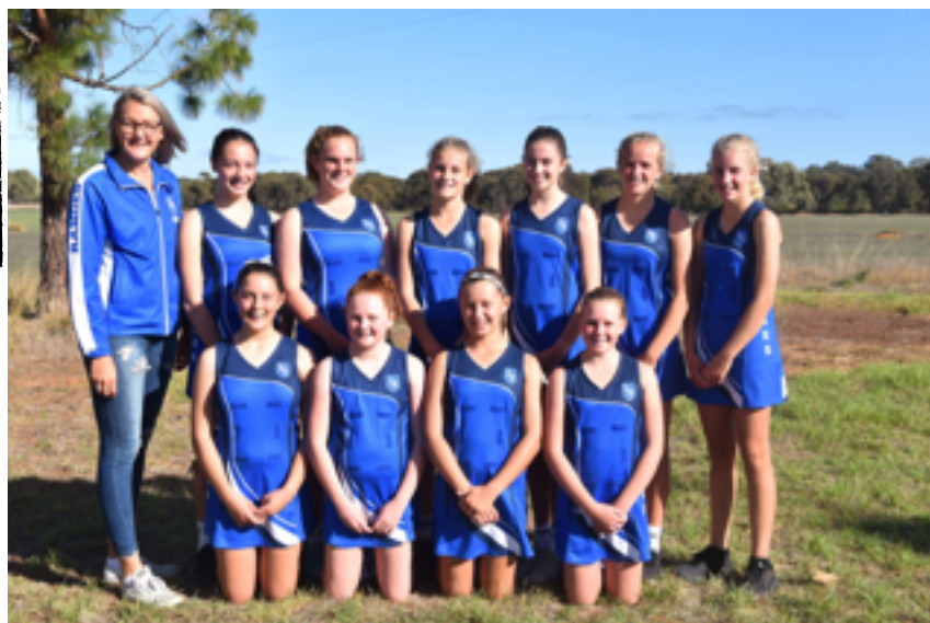
Above- Winners of the day at the Wangary Carnival. Ranges defeated Wanilla Rangers 18-7.