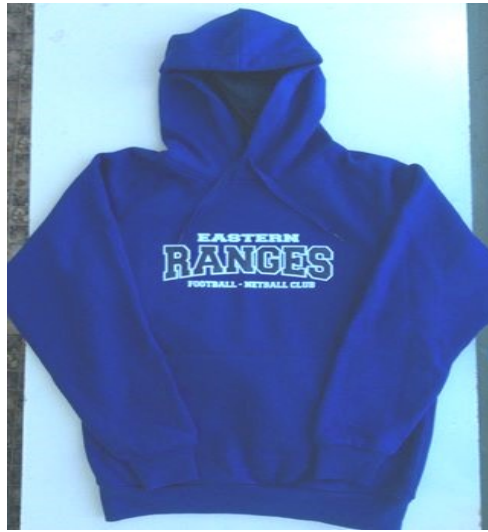
NEW HOODIE - $70