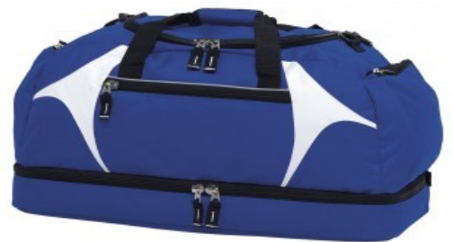
SPORTS BAGS - $40

Fiona will be at the first training at Rudall from 5pm to take orders. There will be some merchandise on hand to buy and to try on for sizing.