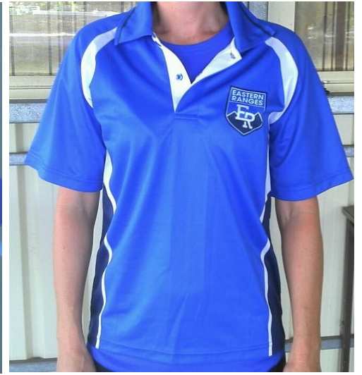
POLO - $40