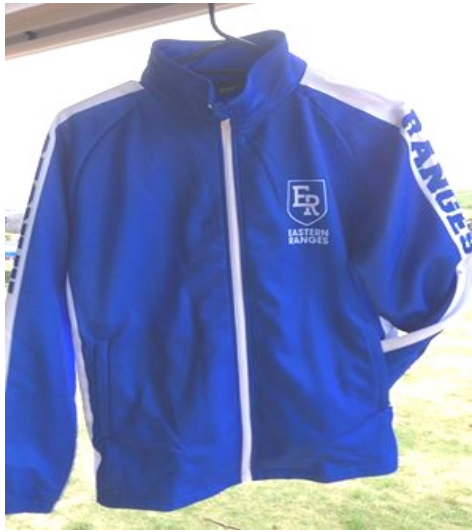
NEW RETRO JACKET- $70

Contact Fiona Evans: ftevens3@bigpond.com 8620 7168 | 0411 664066