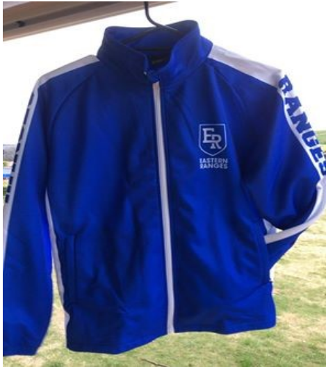
NEW RETRO JACKET- $70