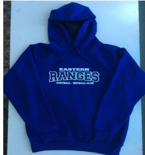
NEW HOODIE - $70